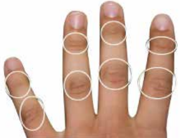
Bayan gaɓɓan 'yan yatsu

Su ne, bayan gaɓɓan 'yan yatsu waɗanda suke bayan tafin hannu