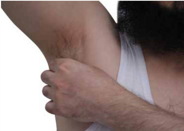
Tsige gashin hammata

Shi ne gusar da gashin da ya fito a hammata, saboda tsaftace hamata da gusar da warinta.